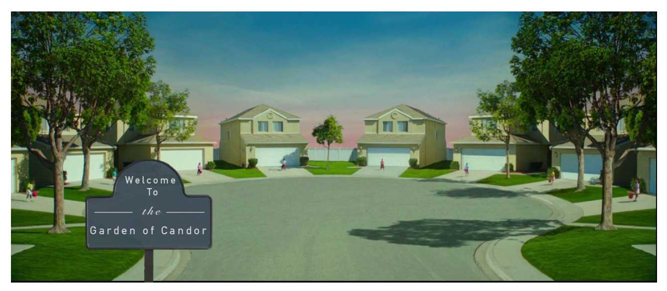
Locust Art Builders (LAB), promo image designed by LAB students