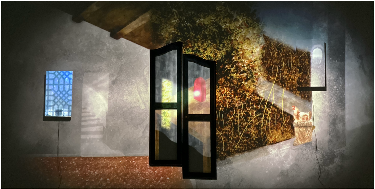
Tara Aliya Kesavan & Indranil Choudhury, Installation view of Current Occurrences , 2022.